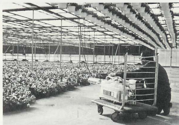
MISTER III™ gives you easy, reliable starts. Fast, economical and total coverage.

Mister III™ also features Dyna-Fog®'s patented electric starting system to assure greater reliability, effectiveness and ease of operation.